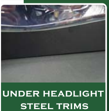
UNDER HEADLIGHT STEEL TRIMS