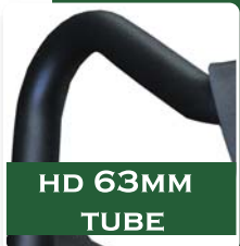
HD 63MM TUBE