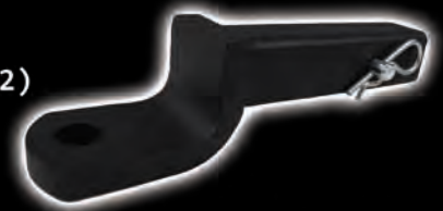
Includes tow hitch