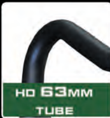
HD 63MM TUBE